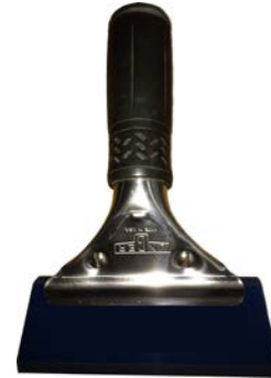
Standard Squeegee (for 3M™ FASARA™)